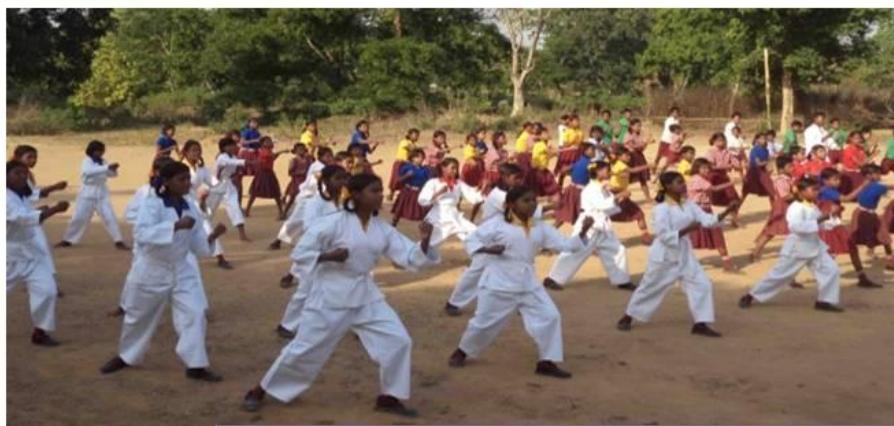
A glimpse of Karate classes for the children