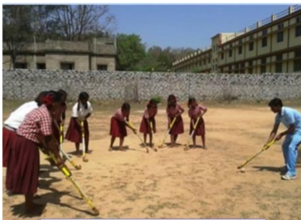
A Glimpse of Hockey Session