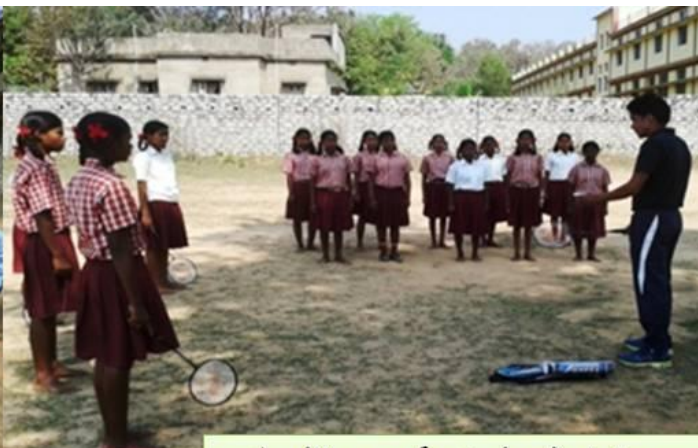
A glimpse from badminton